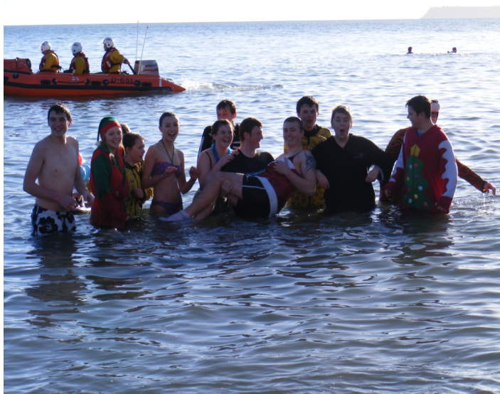
200 Sqn splash around on Boxing Day. See Page 12