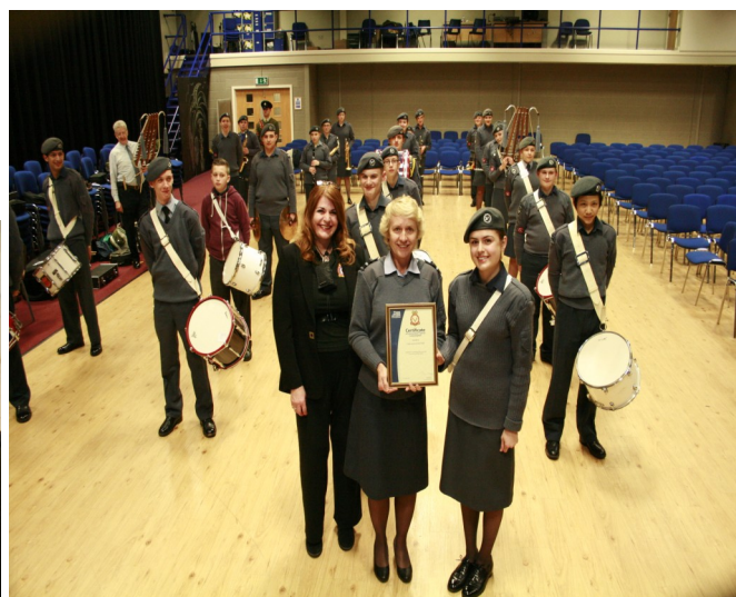
Commandant Air Cadets visits The Band during practice. See Page 7

A world championship athlete inspires at the Wing Conference. See Page 13.